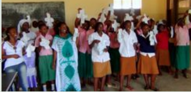
A group of women during the training

jukumu la kujitolea la kuwawezesha wakaaji wengi katika jamii za eneo la mradi kama tulivyoweza.