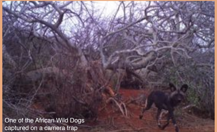
One of the African Wild Dogs captured on a camera trap

ziliwanasa mbwa mwitu wakubwa wawili na watoto wanane wakiingia na kutoka katika pango lao. Baada ya tukio hili, tumeweza kuwaona mbwa mwitu mara mbili tena, ndani ya mwaka huu. Matukio haya ni ishara dhahiri ya utajiri wa viumbe hai tuliobarikiwa nao katika Ukanda wa Kasigau na pia umuhimu wa ukanda huu kama kimbili la wanyama kutokana na makazi ya watu, na wawindaji haramu. Shirika la kimataifa la uhifadhi lijulikanalo kama International Union for Conservation of Nature (IUCN) limewatambua mbwa mwitu kama kati ya wanyama wanaokumbwa na hatari kubwa Zaidi ya kuffia duniani. Kwa sasa inakisiwa kuwa idadi ya mbwa mwitu wa Kiafrika duniani ni takriban elfu sita pekee yake!