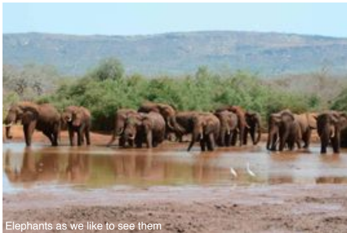
Elephants as we like to see them

Furthermore, Wildlife Works has also employed six additional wildlife rangers from the surrounding communities in order to increase manpower. The new recruits have already been orientated with Wildlife Works' security operations and they have all been posted to the various ranger camps where they are taking up their patrol and surveillance responsibilities. Wildlife Works continues to be committed to the protection of wildlife and will do everything in its power to prevent the further slaughter of these majestic animals.