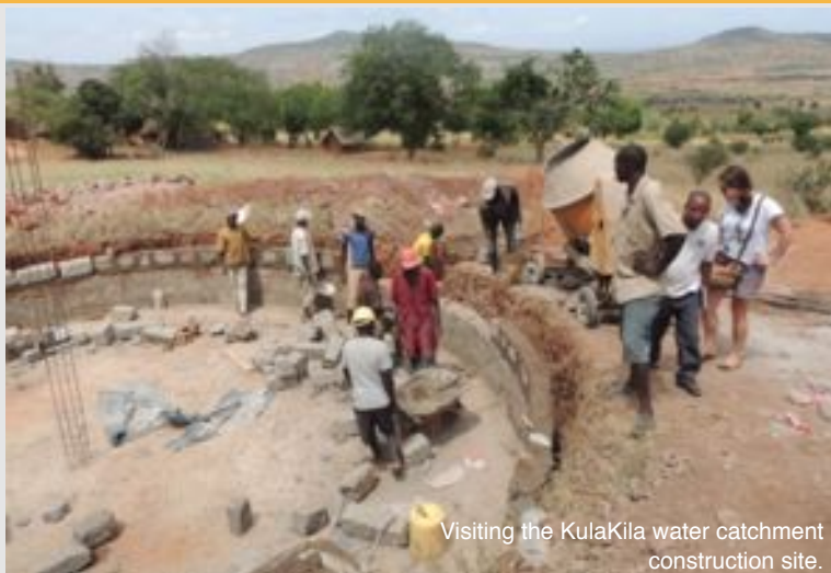
Visiting the KulaKila water catchment construction site.

Baadaye ASOS walitoa mchango wao wa shilingi laki mbili na elfu ishirini na nne, mia nane na ishirini na tano (224,825) (USD 2580) kwa ajili ya kutengeneza madawati hamsini ya shule ya upili ya buguta. Mchango wao mkubwa ulikuwa kwa ujenzi wa kula kila rock catchment uliopo kasigau. Kwa mradi huu, ASOS Foundation walitoa shilingi milioni tano, laki saba na elfu sabini na saba, mia mbili na sitini na tisa (5,777,269) USD (66200) ambazo zilitumika kuchimbua ardhi, kujenga kuta na tenki la maji la kiasi cha lita laki mbili na hamsini! Mradi huu ulifaulu vyema na kusaidia jamii zinazoishi karibu, kwani maji hayapatikani kwa urahisi maeneo hayo makame. Lakini kupitia tenki hilo jamii itaweza kupata maji yaliyotegwa wakati wa mvua na kuyatumia wakati wa ukame. Kwa mwaka huu, mvua iliyonyesha imejaza tenki hilo mara mbili na ni matumaini yetu itaendelea hivyo hivyo. Ufunguzi rasmi ulifanyika tarehe 18.6.2014 wakati wakurugenzi wa ASOS walipokuja.