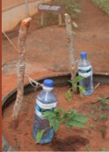
Experimental drip irrigation

alternative livelihood options to the community and improve food security in an environmentally friendly way. The Greenhouse department now operates six different projects, with another one in the pipeline, each of which focuses on a different aspect of sustainable agriculture.