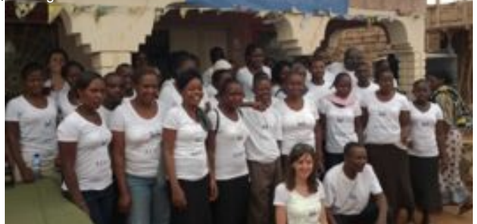
Team SOKO in front of the newly opened Stitching Academy in Maungu

Kutakuwa namihula minne kwa kila mwaka na inatarajiwa kuwa muhula wa pili utang’oa nanga hapo Septemba mwaka huu. Hii ni nafasi kubwa kwa kila mtu ambaye angetaka kujifunza ushonaji