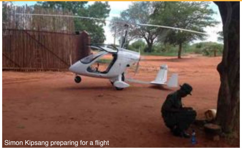
Simon Kipsang preparing for a flight