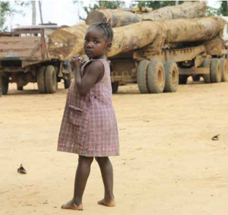
Logging and forest communities in DRC.