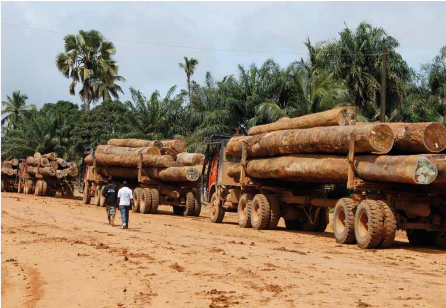
Trucks transporting in Atlantic Resources logyard in Greenville port Liberia.

The VPA partner countries and main exporters of tropical timber to the EU are characterised by high levels of fragility and corruption and have poor ratings when it comes to rule of law and freedom of information and expression. This is illustrated by the chart on the following page which collates the various rankings available. This demonstrates the strong probability that the EU's tropical timber supply chain is contaminated with corruption. It also highlights the importance of ensuring that the EU's policies in the forest sector prioritise the principles and policies that are essential to an effective anti-corruption policy.