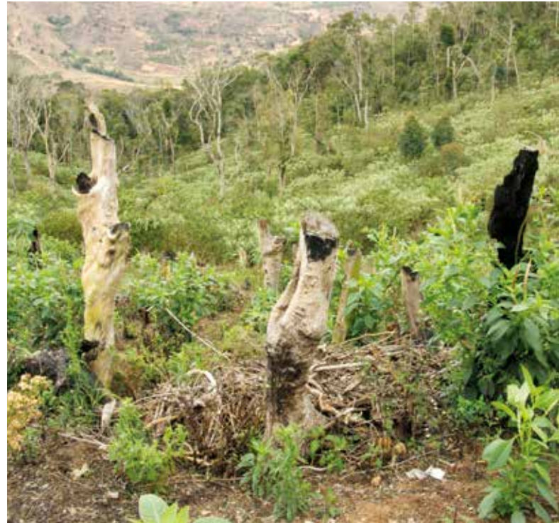
Effects of illegal logging in Madagascar.