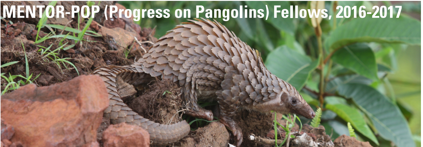
Tree pangolin, also known as African white-bellied pangolin.

The U.S. Fish & Wildlife Service (USFWS) MENTOR Programs bring together teams of emerging conservation leaders and combine rigorous academic and field-based training, long-term mentoring, learning through experience, and project design and implementation to address major threats facing wildlife populations. These fellowship programs help strengthen capacity in-country – a fundamental objective of the USFWS in Africa.