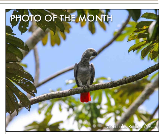
One of the 36 African Grey Parrots that flew free from the Bomassa Wildlife Rehabilitation Centre this month. Read more in our blog post on the release.

- Important maintenance program carried out further raising the safety level of operations. The aviation program's two permanent observers completed a digital photography course and received training on the use of SMART.