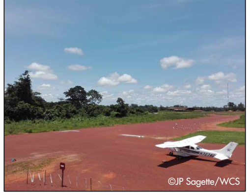
The WCS Congo Aviation Program Cessna 206 parked at the Kabo airstrip.