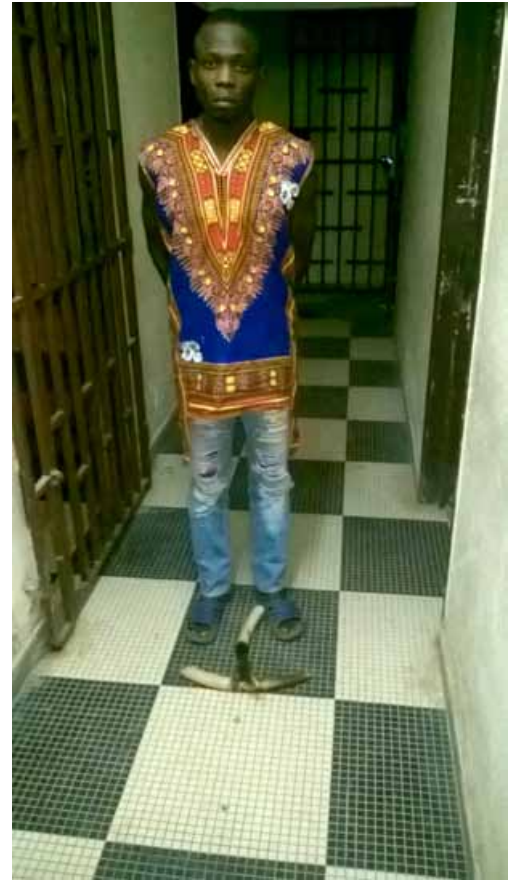
A logging company officer arrested trafficking two tusks in the centre of the country.

during an attempt to sell the contraband, which was concealed in his backpack. Later he admitted killing the elephant.