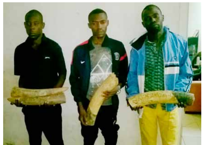
3 traffickers were arrested with 2 ivory tusks, one of them Nigerian, in Gabon

5 ivory traffickers, arrested in January 2018 in Congo, were prosecuted. 3 of them were sentenced to 3 years in jail, while the two others to 1.5 year suspended. 2 ivory traffickers, arrested in February 2018 in Congo, one of them former military officer, were prosecuted and sentenced to one year in jail both.