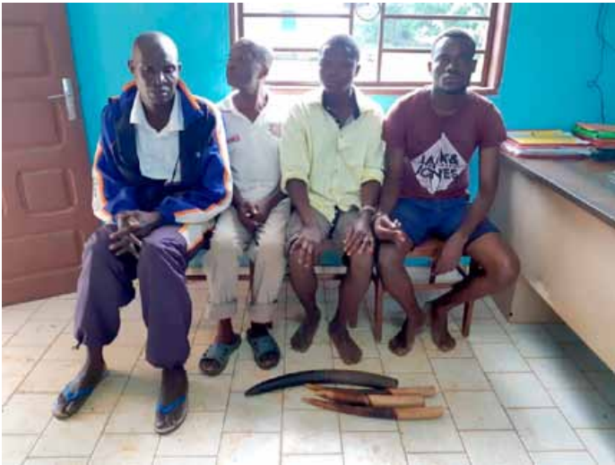
4 ivory traffickers, one of them a notorious Nigerian trafficker, arrested with 4 tusks in the North-East of the country.

African Republic to meet with WWF, WCF, African Parks and UNFWS, where he discussed cooperation in fighting wildlife crime. He also spent several days in Brazzaville and to supported PALF project in management.