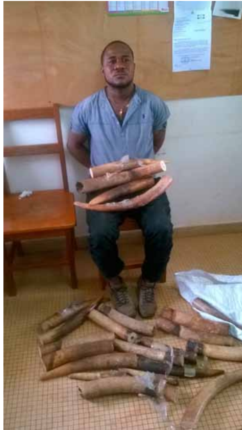
4 ivory traffickers including a corrupt gendarme arrested at a coast town on the South of the country. The Nigerian head of the ring with the contraband

■ 4 ivory traffickers including a corrupt gendarme arrested at a coast town on the South of the country. First a Nigerian trafficker was arrested during an attempt to sell 27 kg of ivory. As a head of a large ivory trafficking ring operating in coastal area of South Gabon he had been in a target of investigations for several months. He was arrested while attempting to traffic a large amount of ivory, concealed in a box. He denounced three more criminals, including a corrupt gendarme at the Naval Brigade, who was providing poachers with ammunition. The two poachers, one of them from Mali, were arrested as well, and more ammunition was found during a house search.