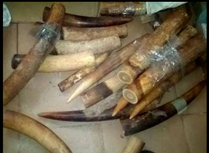
4 ivory traffickers were arrested in Gabon with 27 kg of ivory, one of them a Nigerian trafficker, a head of a large ivory trafficking ring, another one a corrupt gendarme at the Naval Brigade,