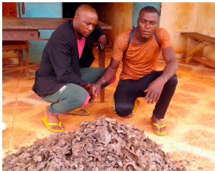
3 traffickers were arrested with 35kg of pangolin scales at the East of Cameroon.

13 ivory traffickers were arrested in 4 operations in Gabon including a corrupt gendarme. 4 ivory traffickers were arrested at a coast town on the South of the country. First a Nigerian trafficker was arrested during an attempt to sell 27 kg of ivory. As a head of a large ivory trafficking ring operating in coastal area he had been in a target of investigations for several months. He denounced three more criminals, including a corrupt gendarme at the Naval Brigade, who was providing poachers with ammunition. A logging company officer was arrested trafficking two tusks in the centre of the country. An ivory trafficker was arrested with 2 ivory tusks, elephant hairs and leopard teeth. 3 traffickers were arrested with 2 ivory tusks, one of them Nigerian, in the East of the country. The Nigerian trafficker, well known to authorities as a long-term criminal, was arrested in a hotel room when he was waiting for his client. He quickly denounced two more traffickers involved in the case, they were arrested afterwards in their houses. 4 ivory traffickers were arrested with 4 tusks in the North-East of the country. First of them, a notorious Nigerian trafficker, was arrested in the act with the contraband. After arriving to the police station, he denounced three other traffickers involved in the illegal activity.