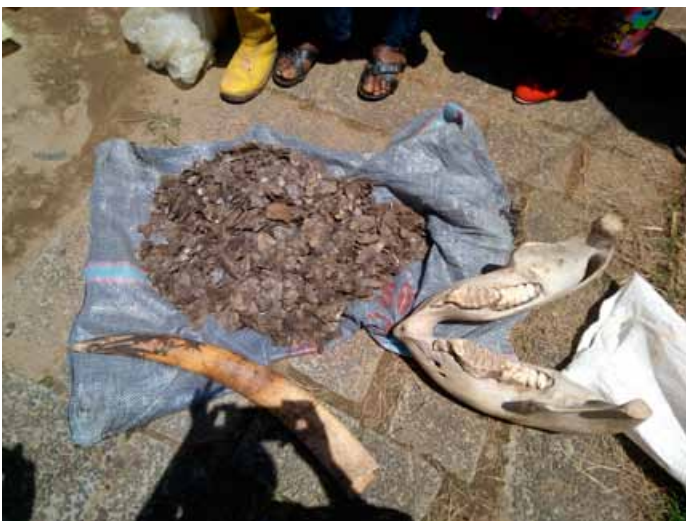
4 traffickers were arrested with an ivory tusk, pangolin scales and elephant bones in Cameroon

■ 3 traffickers arrested with 35kg of pangolin scales at the East of the country. First two traffickers were arrested with a bag containing the pangolin scales and were taken to the gendarmerie brigade alongside two bikes they had used for transporting the contraband. The third one escaped leaving behind his bike. When he realized that the bike had been impounded, he arrived to