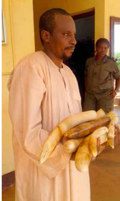
An ivory trafficker was arrested with 7 ivory tusks and hippo teeth

■ 4 traffickers arrested with an ivory tusk, pangolin scales and elephant bones. They used motor-bikes to transport the contraband as it is very flexible and easy to use for escape when threatened. They were arrested shortly after they began negotiations to sell the contraband, originating from the Santchou wildlife reserve that has been depleted of its wildlife resources and now is in a very bad state. One of the traffickers has been known by the conservator of the reserve as a major target for arrest. He was very alert and attempted to escape when he realized the team was moving in for the operation.