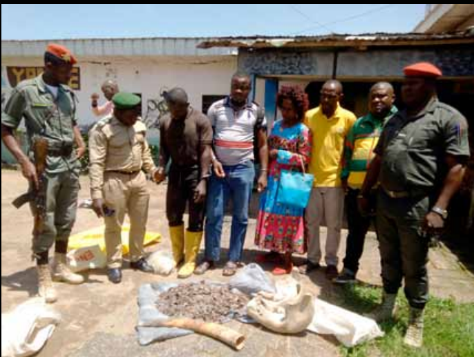
4 traffickers were arrested with an ivory tusk, pangolin scales and elephant bones in Cameroon