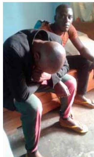
3 traffickers were arrested with 35kg of pangolin scales at the East of Cameroon.

the gendarmerie brigade to bribe for the release of the bike and was immediately arrested. He had been collecting pangolin scales from surrounding villages and supplying to other traffickers from the big commercial centers of Yaoundé and Douala.