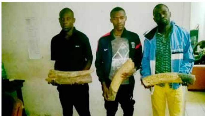
3 traffickers arrested with 2 ivory tusks, one of them Nigerian, in the East of the country.