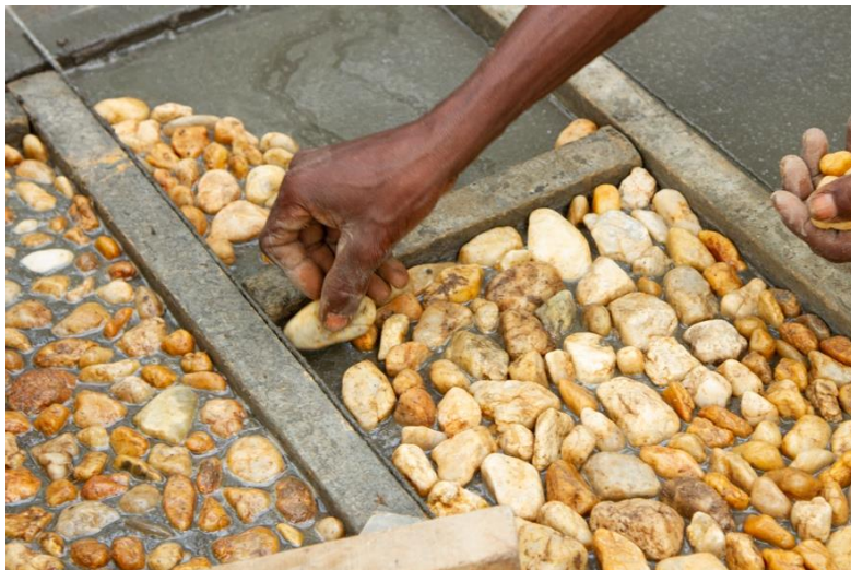
Stone by stone...

The pavements at Doli Lodge have been covered with cement and stones, as they had become slippery and sometimes dangerous.