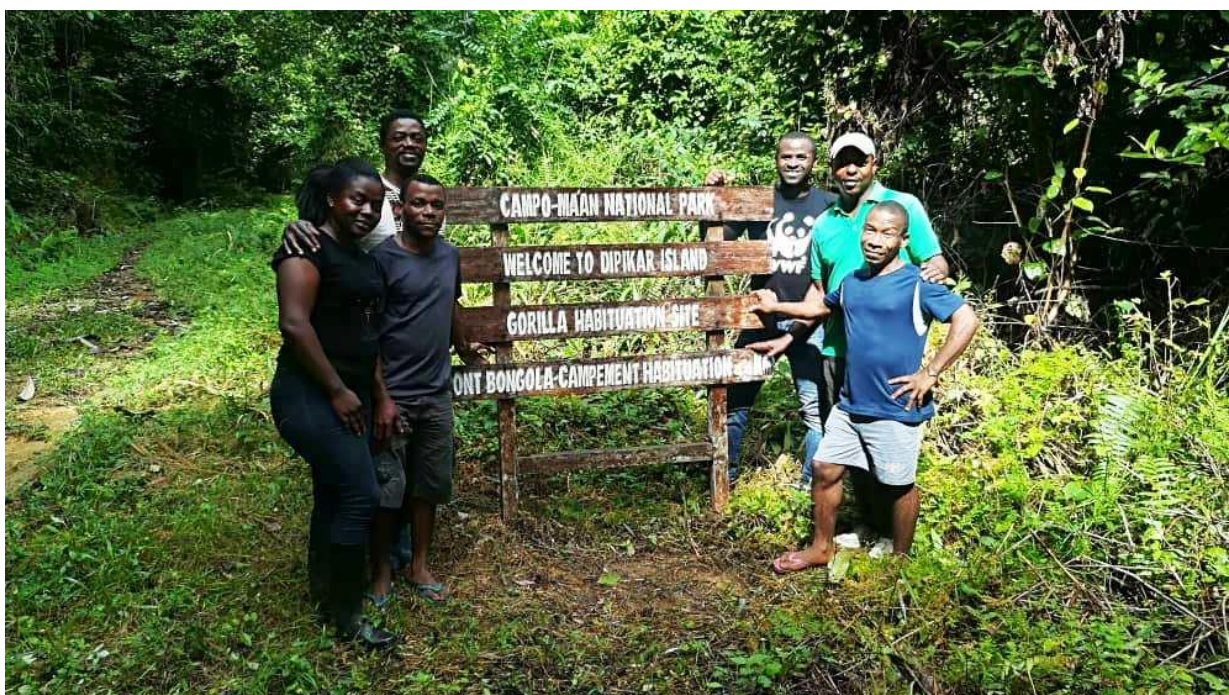
The DS team in campo Ma'an

The PHP manager and two experienced Ba'Aka trackers spent a month with the gorilla habituation team in Campo Ma'an National Park, Cameroon. They went to evaluate the habituation field staff and their habituation technique, carry out refresher training on tracking techniques, making appropriate contacts and introduction to working with tourists as well as to share experiences of Dzanga Sangha with the campo Ma'an team.