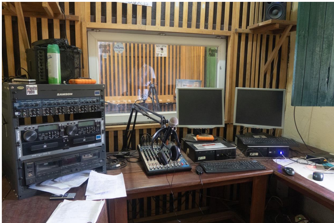
Radio Ndjoku help us to protect DS

4 radio programs were produced and broadcast over Ndjoku Community Radio on the rights and duties and legal instruments for the protection of indigenous peoples at both the national and international levels