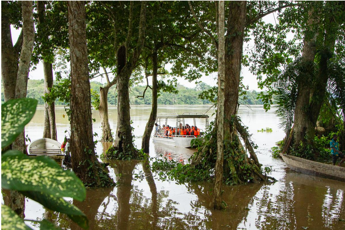
Arriving at Doli Lodge

Although we are in the rainy season, the rain this month has been especially intense. We recorded 310 mm of rainfall as compared to 230mm in October last year. This makes transport by boat easy as the river level has considerably risen, but circulation along the tracks in the Park has become somewhat complicated.