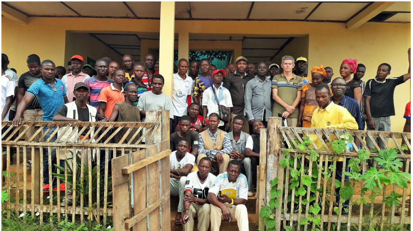
Meeting at Salo

Salo is a town located north of DS hosting most of the elephant poachers in the region. This month we had a meeting with the population there facilitated by the park and the mayor of the town to discuss ways to improve our relationship. The population of the town complained about being left out of community development efforts. We are now assessing the possibility of integrating Salo into community development projects.