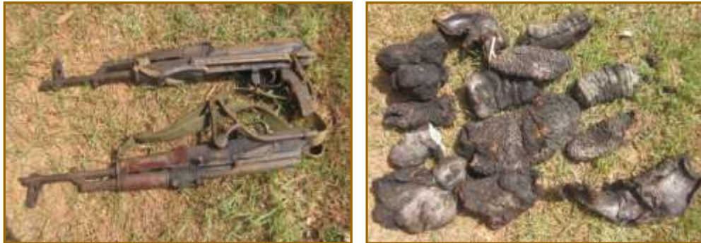
Figure 5. Photos taken during Operation Wendi by the Congolese authorities in 2013. The photo on the left shows two PMAK arms that were seized at the same time as four magazines, 1 axe, 1 saw, and 13 pieces of elephant meat and one ivory tusk.

There are also connections between ivory smuggling and illegal logging across Southern and Eastern Africa. In 2013, INTERPOL Operation Wildcat identified major smuggling networks in East Africa involved in trafficking elephant ivory and illegal shipments of timber and charcoal. Smugglers were found to be concealing ivory inside charcoal containers or inside welded chambers of trucks used to transport logs across borders (figure 6). The operation resulted in the seizure of 240kg of elephant ivory, 856 timber logs, 637 firearms, illicit drugs, 44 vehicles and the arrest of 660 people.