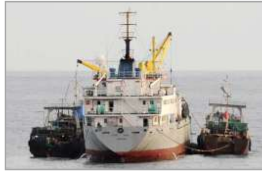
Figure 3. Transshipments from fishing vessels.