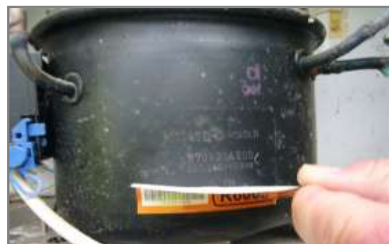
Figure 2. Concealment methods associated with pollution crime, including the use of fraudulent documents, false labels and paint.