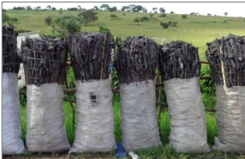
Figure 6. Charcoal uncovered during Operation Wildcat in 2013.

There are also connections between ivory smuggling and illegal logging across Southern and Eastern Africa. In 2013, INTERPOL Operation Wildcat identified major smuggling networks in East Africa involved in trafficking elephant ivory and illegal shipments of timber and charcoal. Smugglers were found to be concealing ivory inside charcoal containers or inside welded chambers of trucks used to transport logs across borders (figure 6). The operation resulted in the seizure of 240kg of elephant ivory, 856 timber logs, 637 firearms, illicit drugs, 44 vehicles and the arrest of 660 people.