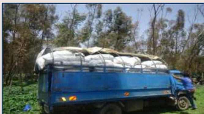
Figure 8. Illegal charcoal apprehended with the suspects in Eastern Africa.

Charcoal is made by burning wood in an enclosed area at high temperatures. Locals are hired in groups, generally comprising 10 to 20 men, by the charcoal traders. The traders provide them with supplies such as tools, medicine, money and food rations. The men are hired to cut down acacia trees, some of which are allegedly over 500 years old. The timber is then partially burnt for up to ten days in kilns dug into the earth, before being cooled for several more days. Once produced, the charcoal is bagged and loaded onto trucks for transport to storage areas at or near the export points. The workers are then paid, minus the cost of their expenses incurred during production. As the payments are insufficient to sustain themselves and their families, they return to their jobs, ultimately becoming embroiled in the production and trade of illegal charcoal.