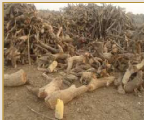
Figure 9. Forest destruction associated with charcoal production.

In 2012, the UNSC responded to the situation by imposing a ban (through the adoption of Resolution 2036) on the direct or indirect import of charcoal from Somalia to reduce “terrorist funding” and to prevent an “environmental crime” – irrespective of whether or not such charcoal originated in Somalia 6 . The ban, however, has been difficult to enforce and the revenue generated has in fact increased since being implemented. According to the UNSC, the overall size of the illicit charcoal export from Somalia has been estimated at USD360 to 384 million per year 7 .