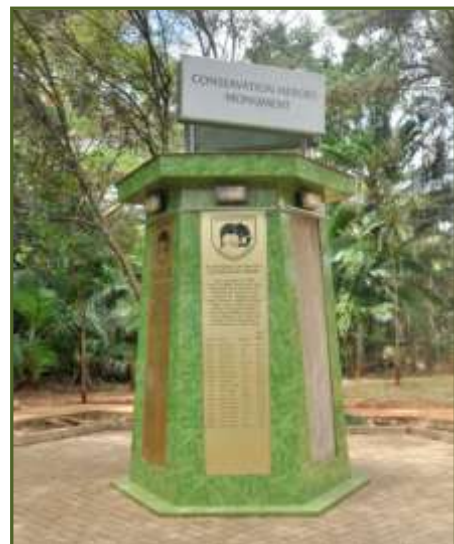
Figure 7. Conservation Heroes Monument in Kenya, with the inscription: "These great heroes died in combat with armed bandits, preventing wildlife crimes, on rescue missions and protecting property from damage by wildlife."

Corruption can occur at all levels of government. In 2015, the former wildlife director and head of the CITES Management Authority of Guinea was arrested in relation to an allegation of corruption and fraud relating to the issuance of CITES export permits. This case highlights the pervasive nature of corruption among officials and how this adds another dimension and potentially inhibiting factor to detecting and disrupting criminals involved in environmental crime.