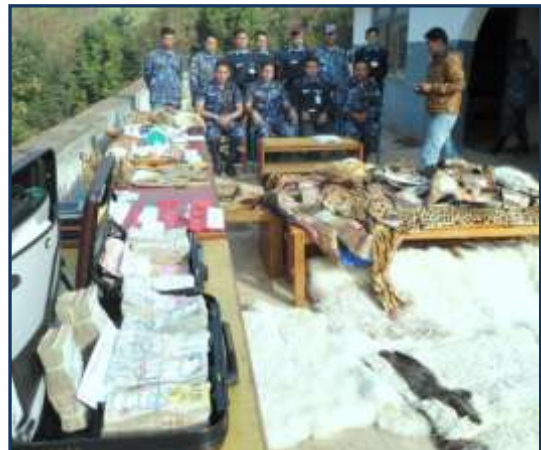
Figure 4. Successful seizure of Asian big cat skins and large sums of cash by the Nepal Police.